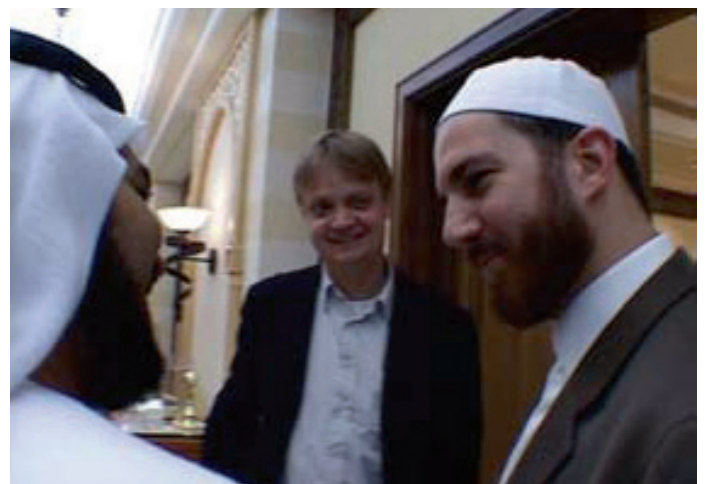
Tabah staff welcoming a Danish Delegate at upon their arrival at Abu Dhabi Airport Lounge