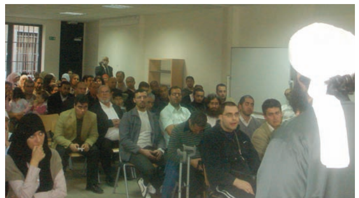
Sheikh Habib Ali Al-Jifri gives a lecture at the Academy in Zayed Hall

T abah Foundation cooperates with the Brussels-based European Academy for Islamic Sciences & Culture to help manage the Academy's operations as well as provide financial and administrative support. A preliminary assessment into the Academy's operations accurately assessed its financial needs and ensured the Academy had correct legal status and accreditation. A refined business plan outlining the next phase of the Academy's development was created from this in-depth assessment, and the Foundation supervised a complete study to establish an endowment (Waqf) to fund these next-step objectives. Additionally, and in an effort to introduce them to the Academy, the Foundation organized meetings and visits for senior Muslim scholars where various lectures and