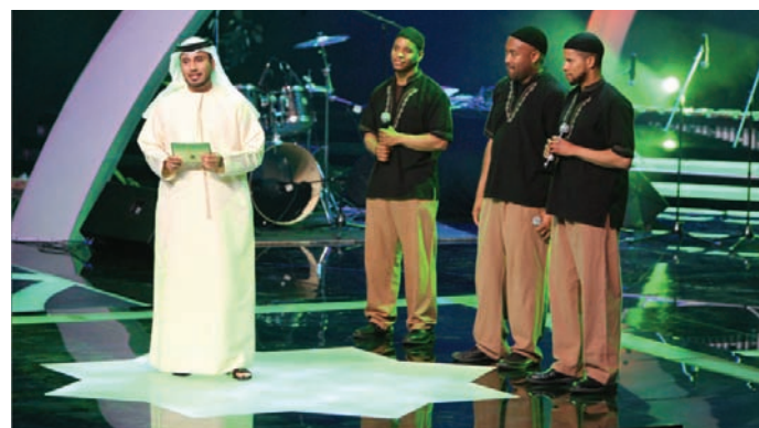
American rap group Native Deen on stage at the second Al Mahabbah Awards in Abu Dhabi

Media attention has also increased significantly. Only one TV channel covered the 2006 ceremony, but that figure rose to four channels in 2008. The Foundation's YouTube channel traffic figures of the 2008 awards ceremony indicated the Al Mahabbah Awards were watched by more than 2