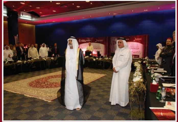
HH Sheikh Nahyan bin Mubarak Al Nahyan welcomes delegates to one of the forums held in Abu Dhabi at Zayed University

Under the management of Al Al Bayt Al Malakiya for Islamic Thought and in collaboration with the Foundation, "A Common Word" initiative was launched in October 2007 from Abu Dhabi ( www.acommonword.com ). 138 Muslim scholars presented an open letter authored in English by H.R.H Prince Ghazi bin Muhammad bin Talal and reviewed by prominent Muslim scholars entitled, "A Common Word Between Us" to the leaders of Christian churches and all Christians worldwide. The letter invited them to recognize the common ground between Muslims and Christians: the Unity of God, the necessity of love for Him, and the necessity of love of the neighbour.