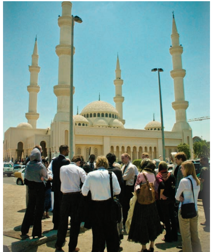
A Danish delegation visits Sheikh Mohammad Bin Zayed Mosque during Friday prayer services

In the aftermath of the Danish cartoons controversy, Tabah Foundation gathered more than a hundred signatories of the nation's prominent scholars from different disciplines, from East to West who unanimously addressed the world in general and Denmark in particular, through a signed declaration condemning the publication of Jyllands-Posten cartoons. And in order to promote open communication, productive dialogue, and freely exchanged opinions, Tabah Foundation also organized familiarization seminars for students, educators, and academic staff, including a visit to the Emirate of Abu Dhabi. More than 70 students and educators from Denmark and some Arabic Islamic countries participated in this visit, which accompanied a four-day conference, in addition to another visit of a group of Muslim youth to Denmark in coordination with the Danish Youth Council. These two events enabled both parties to have a better understanding of some sensitive matters like respect for sacred values and the media role in aggravating some global issues. Then after that, the Danish Youth Council (800,000 members) invited Tabah Foundation to attend a culture exchange conference in Turkey where Tabah gave a lecture entitled “Refuting suspicions about Islam”