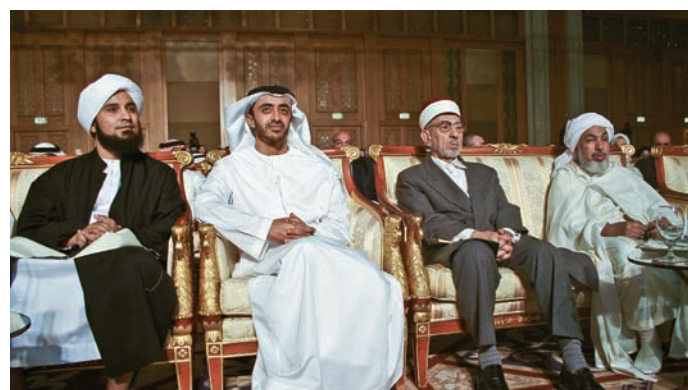
Al Habib Ali AlJifri, HH Sheikh Abdullah bin Zayed Al Nahyah, Sheikh Dr Mohammed Saeed Ramadan Al Bouti, and Sheikh Abdullah bin Bayyah at Al Mahabbah Awards

million viewers in comparison to 200,000 viewers for the 2006 awards ceremony.