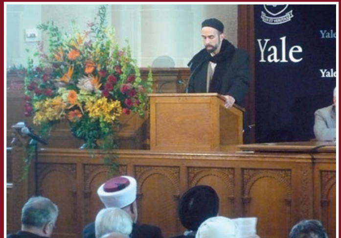
H.R.H Prince Ghazi speaks at the Common Word Conference held at Yale University.