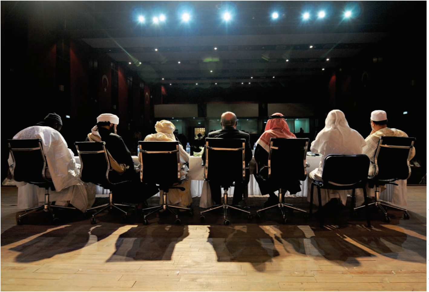
Tabah Foundation General Director among Scholars at a panel for the Mardin Conference in Turkey

Tabah Foundation continues its involvement in many international conferences and forums. Numerous contemporary issues were discussed at such high-visibility events as the Muslim Conference in Europe in 2006, the United States and the Islamic World Conference in Qatar in 2007, and The Prospects of the Islamic Religion Conference in Rome in 2007. Tabah also participated in “The reality of tourism in Islam” conference in Sana’a, Yemen in 2009, Hashemite Scientific Conferences in Jordan on “What we want from dialogue among civilizations” in 2009. Tabah also contributed by providing working papers for “Common Word, theory and practice” at Zayed university in collaboration with the University of Carolina in 2009, and with a working paper in the conference “Towards an Arabic Islamic Contribution to Contemporary Human Civilization” and in “Love in Quran” conference organized by Al Al Bayt Al Malakiya for Islamic Thought. Tabah’s most recent participation was in “Mardin the Abode of Peace” conference at the Artuklu University in Turkey about the categorization of abodes—between the Abode of Peace and the Abode of War and the Dubai Summit “bringing Peace to Somalia” that was held in March of this year.