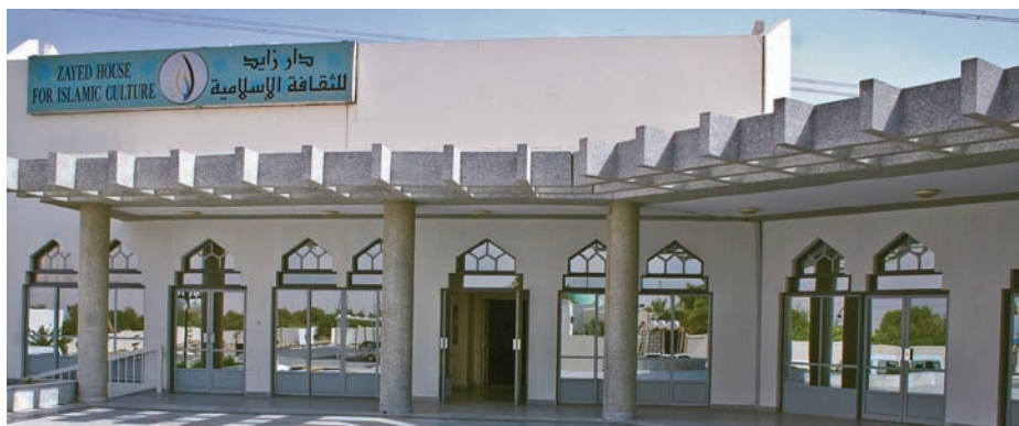
Zayed House Campus, Al Ain, UAE

The aim of Tabah Foundation is to oversee the development of ZHIC and eventually see it counted amongst the ranks of distinguished international institutions. The Foundation has made significant progress in this area and has laid a strategic and educational plan for the coming five years. The Foundation has also supervised the formulation of advanced educational curricula and informational material to serve the needs of new Muslims in accordance with the highest educational standards, which are predicated on extensive studies on the cultural, psychological and social aspects of prospective students' backgrounds and aptitudes. Tabah Foundation adopted these standards which conform to the curriculum development methodology implemented at the University of Toronto, Canada and contracted with Al Razi Consultancy Group for execution. In addition, a teachers' guide has been developed with the latest teaching methods utilizing interactive audio and video learning, as well as a comprehensive and integrated plan for teaching Arabic language to non-Arabic speakers.