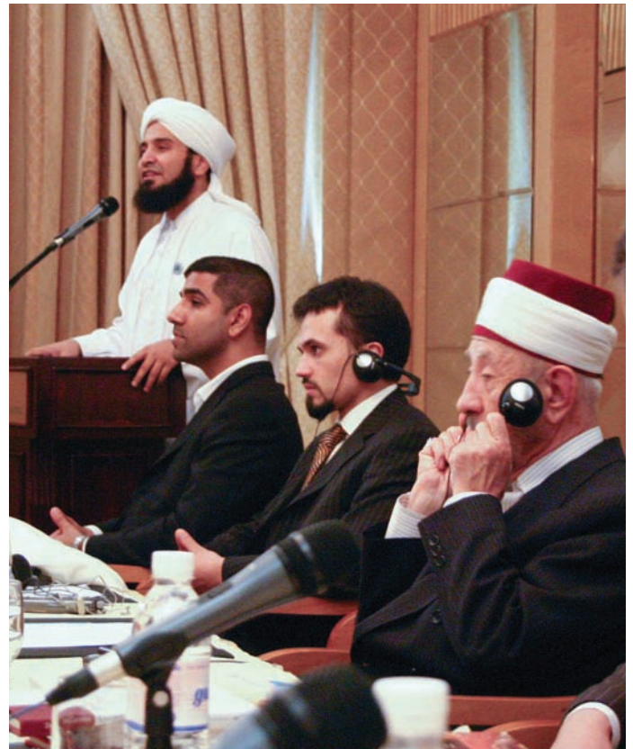
One of the seminars organized by Tabah Foundation in Abu Dhabi

Tabah Foundation continues its involvement in many international conferences and forums. Numerous contemporary issues were discussed at such high-visibility events as the Muslim Conference in Europe in 2006, the United States and the Islamic World Conference in Qatar in 2007, and The Prospects of the Islamic Religion Conference in Rome in 2007. Tabah also participated in “The reality of tourism in Islam” conference in Sana’a, Yemen in 2009, Hashemite Scientific Conferences in Jordan on “What we want from dialogue among civilizations” in 2009. Tabah also contributed by providing working papers for “Common Word, theory and practice” at Zayed university in collaboration with the University of Carolina in 2009, and with a working paper in the conference “Towards an Arabic Islamic Contribution to Contemporary Human Civilization” and in “Love in Quran” conference organized by Al Al Bayt Al Malakiya for Islamic Thought. Tabah’s most recent participation was in “Mardin the Abode of Peace” conference at the Artuklu University in Turkey about the categorization of abodes—between the Abode of Peace and the Abode of War and the Dubai Summit “bringing Peace to Somalia” that was held in March of this year.