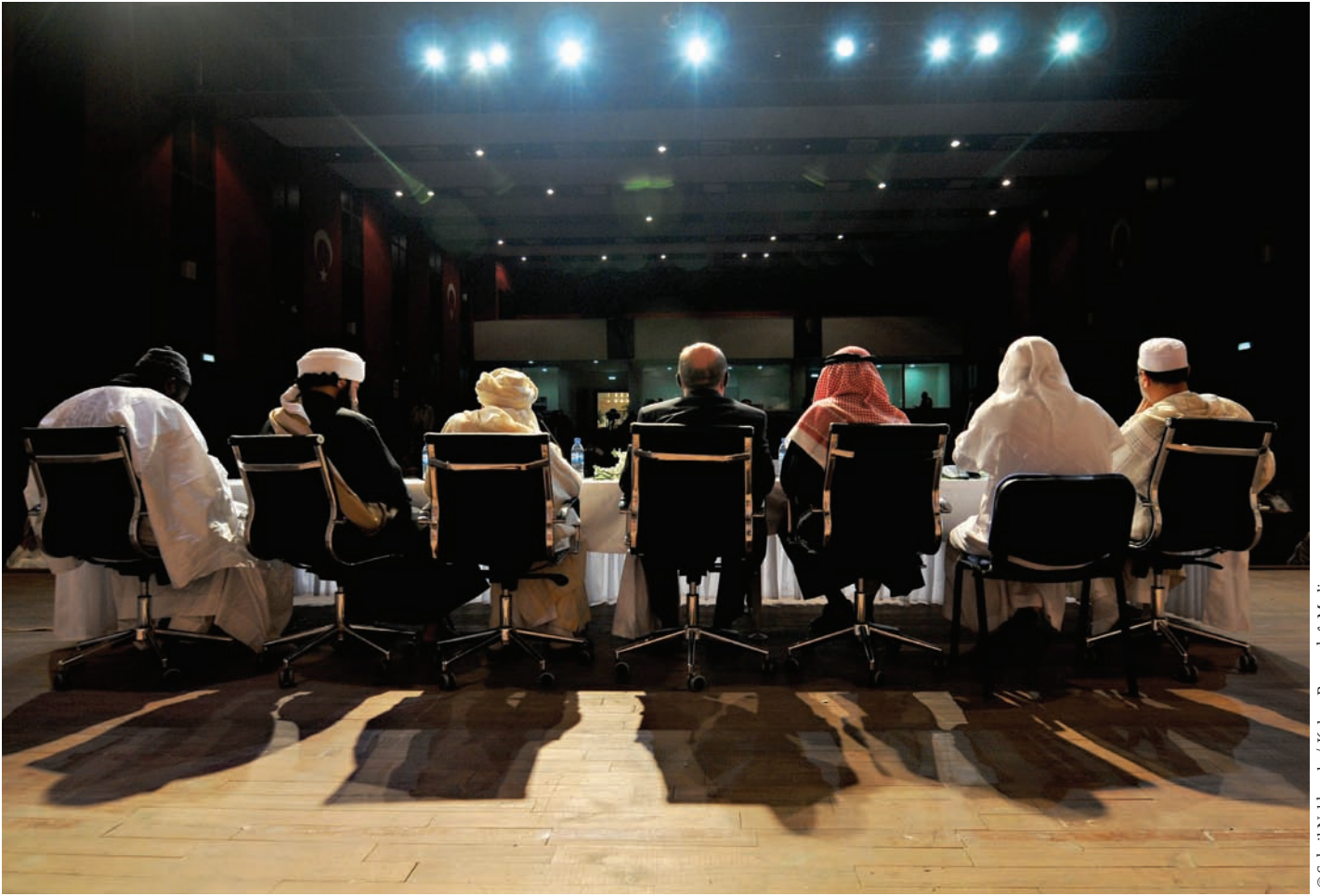
Tabah Foundation General Director among Scholars at a panel for the Mardin Conference in Turkey