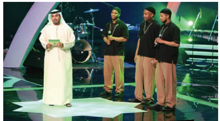
American rap group Native Deen on stage at the second Al Mahabbah Awards in Abu Dhabi

Media attention has also increased significantly. Only one TV channel covered the 2006 ceremony, but that figure rose to four channels in 2008. The Foundation's YouTube channel traffic figures of the 2008 awards ceremony indicated the Al Mahabbah Awards were watched by more than 2