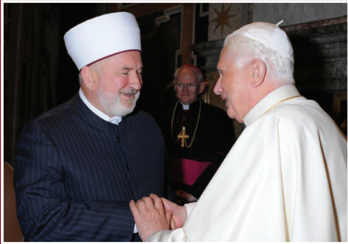
Bosnian Mufti Dr. Mustafa Cerić meets with Pope Benedict XVI at the Vatican