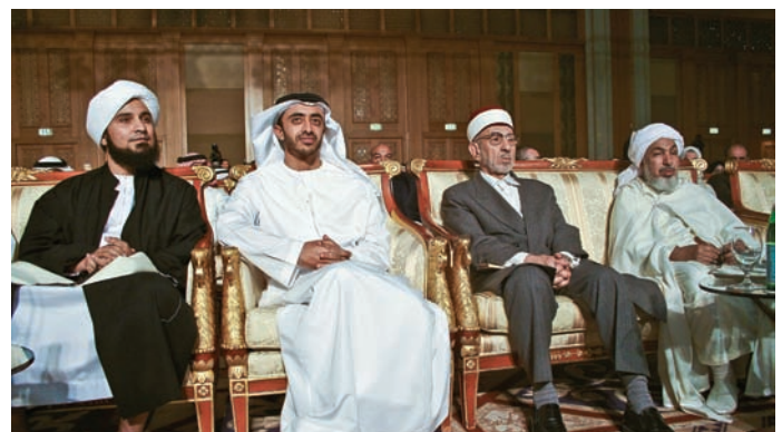
Al Habib Ali AlJifri, HH Sheikh Abdullah bin Zayed Al Nahyan, Sheikh Dr Mohammed Saeed Ramadan Al Bouti, and Sheikh Abdullah bin Bayyah at Al Mahabbah Awards

million viewers in comparison to 200,000 viewers for the 2006 awards ceremony.