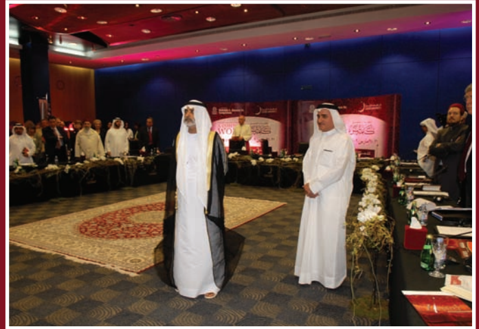
HH Sheikh Nahyan bin Mubarak Al Nahyan welcomes delegates to one of the forums held in Abu Dhabi at Zayed University

Under the management of Al Al Bayt Al Malakiya for Islamic Thought and in collaboration with the Foundation, “A Common Word” initiative was launched in October 2007 from Abu Dhabi ( www.acommonword.com ). 138 Muslim scholars presented an open letter authored in English by H.R.H Prince Ghazi bin Muhammad bin Talal and reviewed by prominent Muslim scholars entitled, “A Common Word Between Us” to the leaders of Christian churches and all Christians worldwide. The letter invited them to recognize the common ground between Muslims and Christians: the Unity of God, the necessity of love for Him, and the necessity of love of the neighbour.