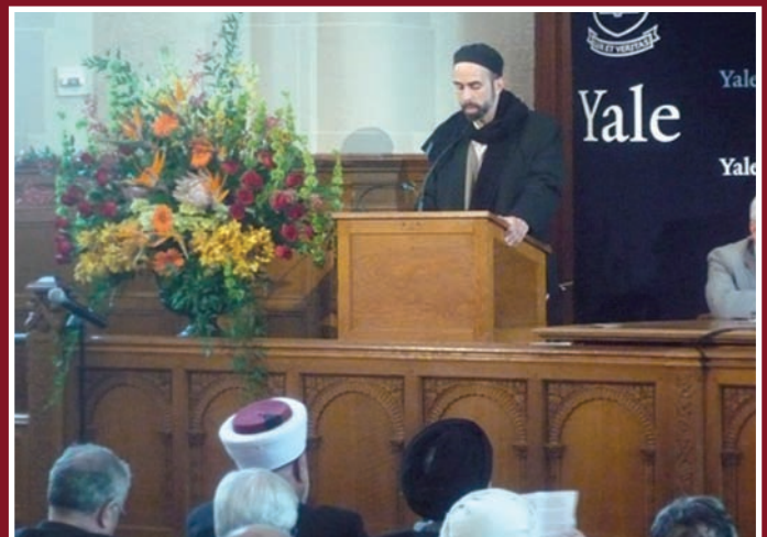
H.R.H Prince Ghazi speaks at the Common Word Conference held at Yale University.

The Common Word initiative resulted in the successful establishment of the Catholic-Muslim Forum whose first round was held in Rome in November 2008, and received considerable media attention; in fact, more than 600 articles in English were written. Many postgraduate-level academic theses were written on the subject at prominent institutions, including Harvard University, the Theology Institute in Germany, and the Institute of Islamic Research in Britain. The initiative won the prestigious Eugen Biser Award in a ceremony held in Munich, Germany, which honored Prince Ghazi bin Muhammad bin Talal, Habib Ali alJifri, and Bosnian Mufti Dr. Mustafa ef. Cerić in recognition of the impact the initiative had in furthering interfaith dialogue, peace, and coexistence.